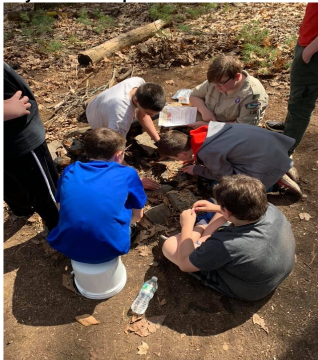
Boy Scouts at Camp Straw

Troop 136 of Epping is very active and has several campouts in its near future, as well as a fundraiser and other activities. In April, they focused on their Geocaching Merit Badge. On April 29 th they split up as a Troop to look for Geocaches in the Fremont area. This required them to do a little hiking, using the Geocache app, and a little bit of seek and find of treasures.