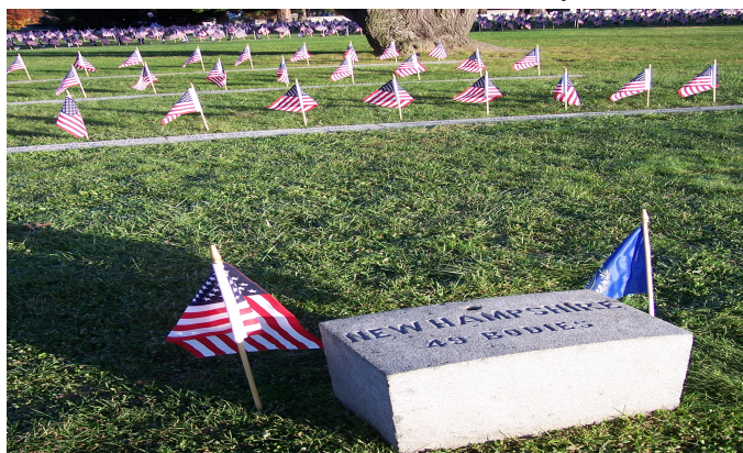
NH graves at Soldiers' Cemetery in Gettysburg

The Civil War Roundtable of New Hampshire welcomes anyone with an interest in the American Civil War who would like to be with others who share the same desire to learn more of this time in American history. We are an informal club with the only requirement being a Civil War enthusiast. If you or a friend has an interest in the American Civil War, we invite you to come check us out.